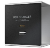
USB and USB-C Socket