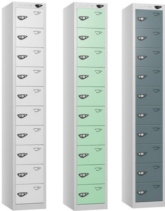
Pure Laptop Charging Lockers - 10 door - 10 compartments

Our Pure Laptop Charging Lockers are designed with 10 individually locking compartments, allowing for maximum protection of your laptop. Available with 13 door colours, and all coated in an anti-bacterial coating, preventing cross-contamination within busy schools, colleges or offices. Choose from a variety of charging options, including UK 3-pin, USB and/or USB-C, ensuring your tablet charging needs are met. Alternatively, our Pure locker range are available as storage-only.